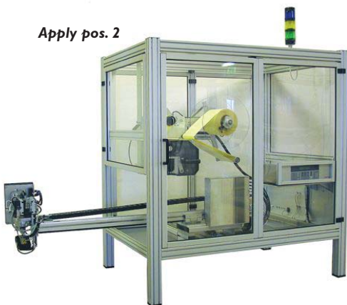
Apply pos. 2