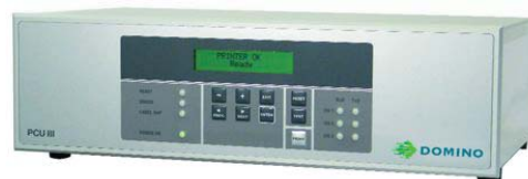
Printer Control Unit (PCU)