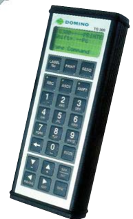
Handheld terminal TG300 (optional)