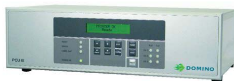
Printer Control Unit (PCU)