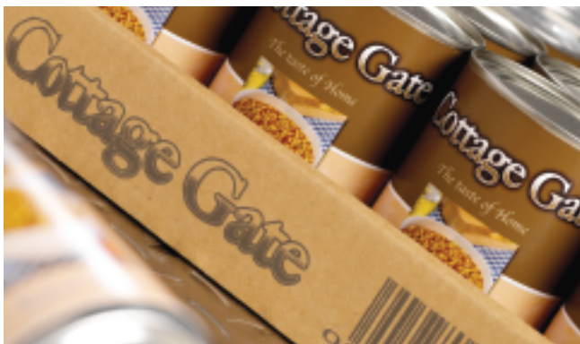
Remote head variants for low level tray coding