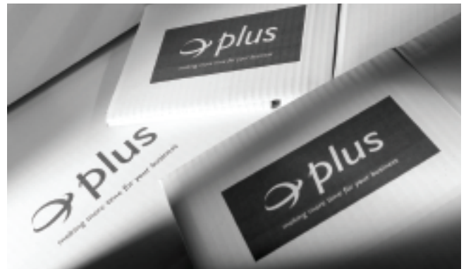
High quality text and graphics capability