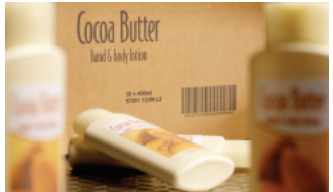
Multi-head C-Series plus on blank outer cases