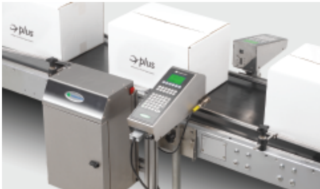
The C-Series plus part of the Domino plus programme