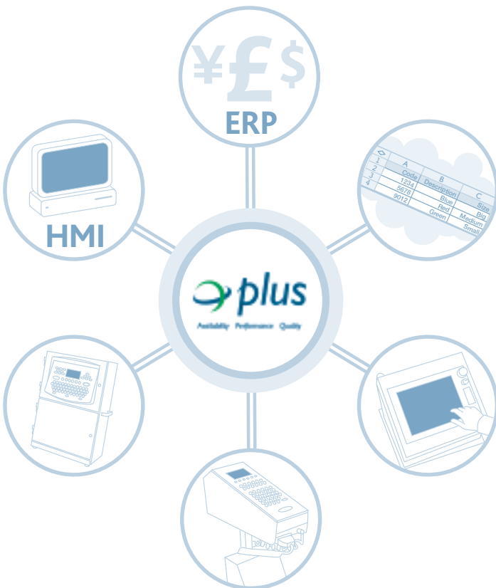
The OPC server eliminates the need for application specific device drivers