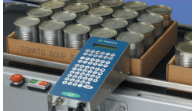
The C-Series standard alphanumeric coder